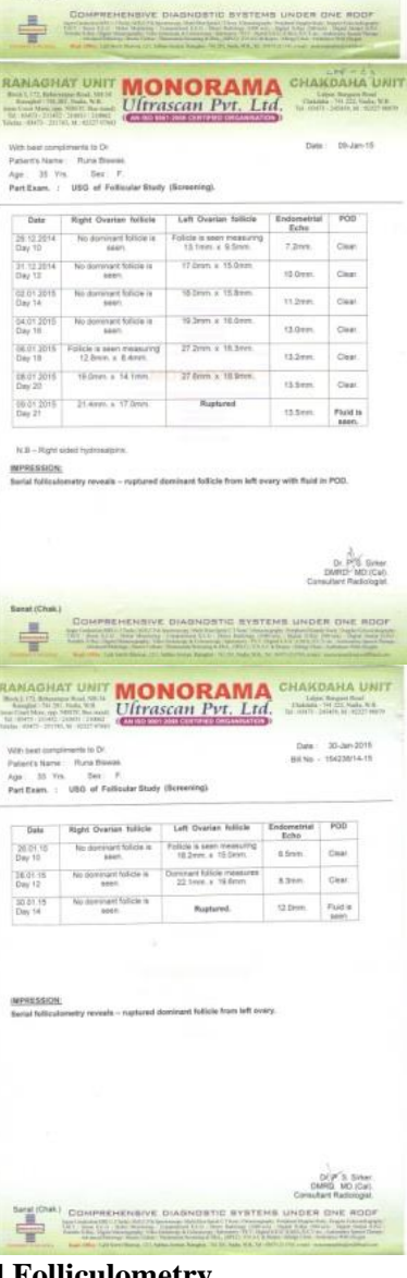
Figure 2: Serial Folliculometry

Serial Folliculometry on 30th January, 2015