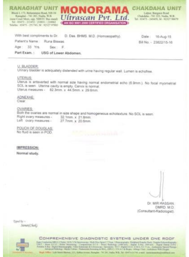
Figure 1: Showing Presence and Absence of Fibroid and Cyst Before and After Treatment